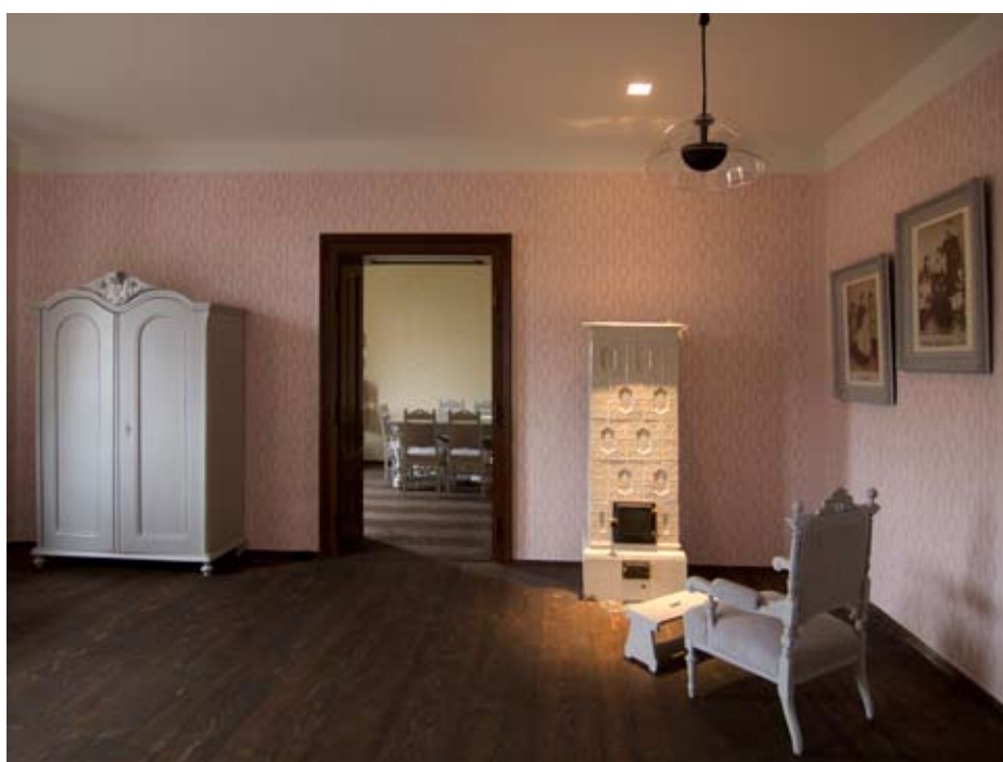
Egon Schiele's Birthplace, Tulln